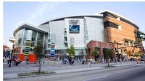
Time-Warner Cable Arena

Backtracking: The Democratic National Convention in Charlotte, North Carolina, began this Season of Electoral Strangeness by denying the nomination to Barack Obama. The amazing O