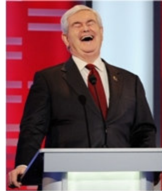
Newt 'the Hutt'

Gingrich, still keeping his eye on the prize, stated he was glad to be leaving Tampa and the rigors of floor politics. He had positioned himself as the Tom DeLay Neocon in the race, counting on several carefully targeted bursts of self-righteous saber-rattling to put him in the winner's circle. But fewer voters these days—not to mention fewer soldiers —seem to be swayed by warmongering... ungrateful louts. Yet the Newtster hung in, dodging ex-wife allegations and Bailout-related 'consulting fees,' to the final (actually, first) ballot.