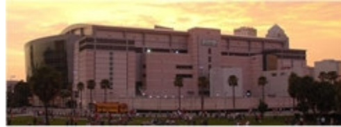
Tampa Bay Forum Building

September 3, 2012, Tampa, Florida. Today at the Tampa Bay Times Forum, the assembled delegates of the Republican Party chose their nominees for the offices of President and Vice President of the United States. 1 Reporters from every major news organization were on hand from the dropping of the gavel on August 27, documenting the leading candidates' activities and would-be policies if they should win back the White House from the Democrats.