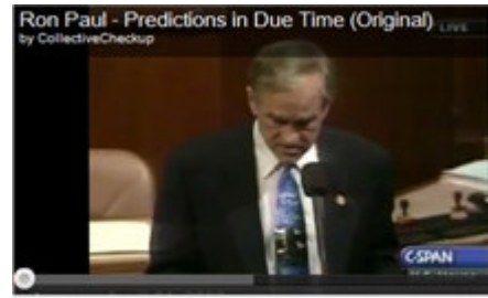
Ron Paul Predictions 2002

Yes, as in Success. Success of an unstoppable movement seeded in the minds of the Scottish Enlightenment and pioneer souls who crossed the perilous ocean in order to live by no one's leave. Then later through ideas spawned in the colonial cauldron of American self-government finding expression in the taverns of Williamsburg and Boston... on to the Declaration of Independence in Philadelphia followed by the clash of arms defeating English tyranny on American soil. 'Our country' then took root in an imperfect, yet best-available, instrument known as the Constitution (USC).