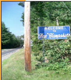
Live Free and Flourish